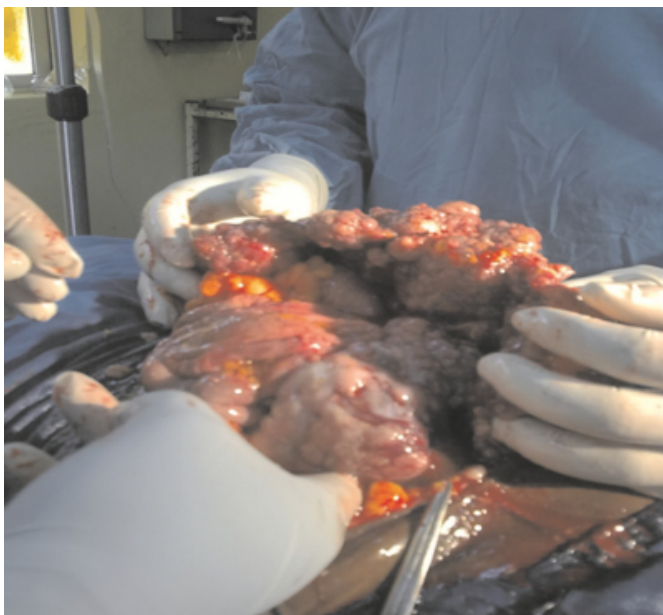
Figure 2: Ovarian cancer mass at surgery