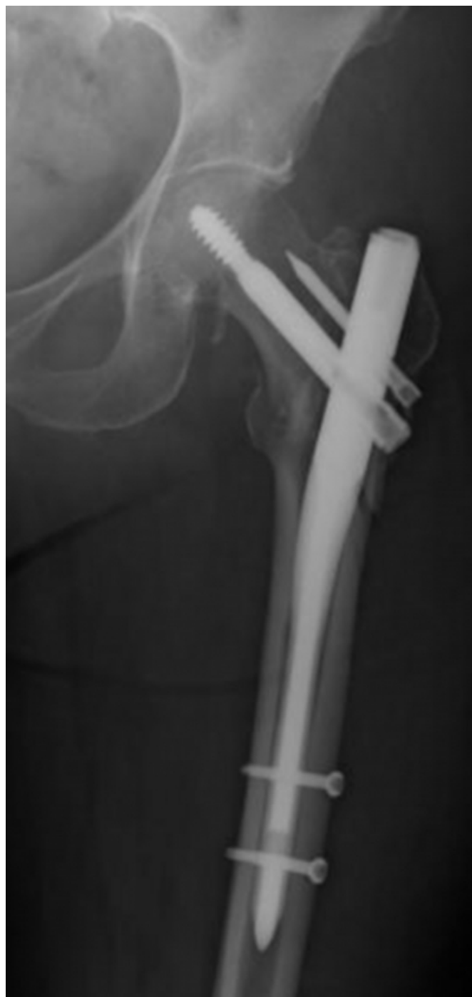
Figure 1: Targon Proximal Femur nail (TPF)