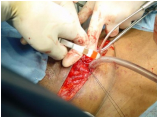
Figure 5: Airway access with armored tube.

Propofol 200 mg and fentanyl 100 mcg were given followed by atracurium 40 mg i.v. After total thyroidectomy, direct laryngoscopy and vocal cords visualization was possible and the trachea was intubated using 7.5mm armored endotracheal tube (ETT) with simultaneous removal of the ETT at the tracheostomy stoma (TS) (Fig 6). The TS was then closed and upon completion of surgery and i.v atropine/neostigmine for reversal of muscle relaxant, the trachea was extubated.