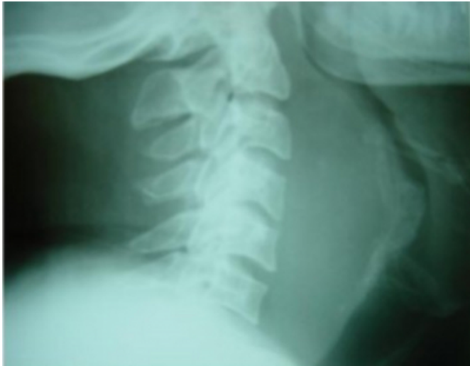
Figure 2: Lateral neck x-ray shows goiter extension to pretracheal and prevertebral areas.

Cardiovascular system examination revealed no added sounds or murmurs. Chest examination showed bilateral good air entry with no added sounds. Chest x-ray showed huge goiter with markedly shifted trachea to the right side (Fig 3). Abdominal examination showed soft and lax abdomen with audible bowel sounds. Laboratory investigations including thyroid function tests were within normal ranges. An ultrasound was done which was suggestive of multinodular goiter. CT scan showed 10x11 cm huge mass involving the pretracheal and prevertebral areas extending to the superior mediastinum with small retrosternal extension (Fig 4). There was no tracheal erosion or infiltration. Fine needle biopsy showed multinodular goiter. Indirect laryngoscopy was difficult to perform. However, fiberoptic laryngoscopy was done and revealed normal vocal cords. Duplex examination was done that showed bilateral normal extracranial carotid arteries with no evidence of compression caused by the goiter. The patient was scheduled to undergo total thyroidectomy under general anesthesia. Airway assessment revealed Mallampati IV with limited neck movement. The plan was to use awake fiberoptic bronchoscopy (FOB) to facilitate endotracheal intubation.