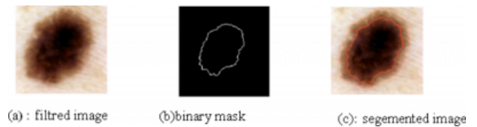
Figure 2: Segmentation results