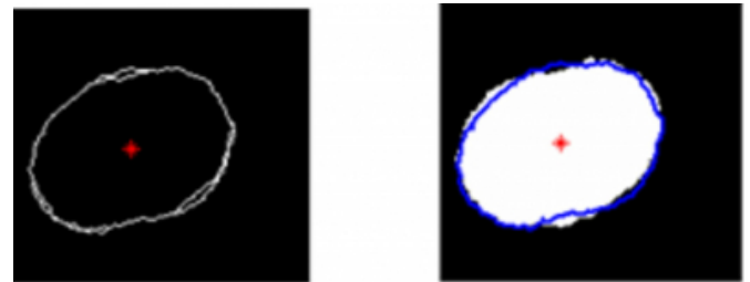
Figure 4: Example of a mask overlaid on its symmetrical (180° center rotation)

So, ultimately our algorithm is as follows: