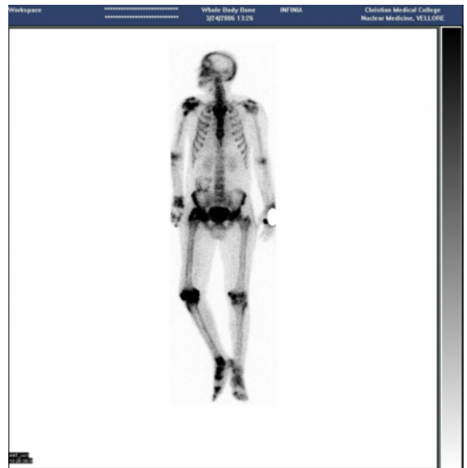
Figure 1: Bone scintigraphy shows evidence of abnormal tracer accumulation in the soft tissues around left hip joint, suggestive of heterotopic ossification. There is an irregular rim of abnormal tracer uptake in the right lumbar region.

It was puzzling since no reason for such a finding could be thought of. On further interrogation of the patient, the reason was disclosed; the patient had undergone craniectomy (Fig. 2) in the past and the vault flap was safely deposited in the abdominal wall ('safe locker') for future replacement.