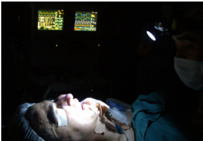
Figure 3: Headlamp in the operation

There was no need extra illumination. Application of the headlight and focusing were quite easy.