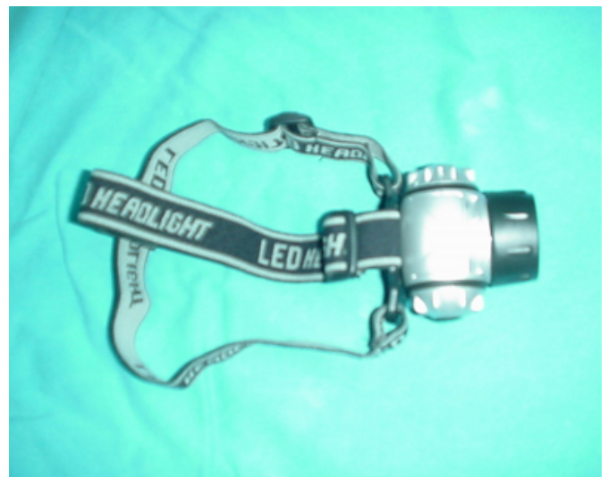
Figure 1: The headlamp for general purposes