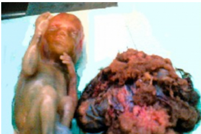
Figure 2: Image of fetus and placenta in ruptured cornual ectopic pregnancy at 18 weeks' gestation