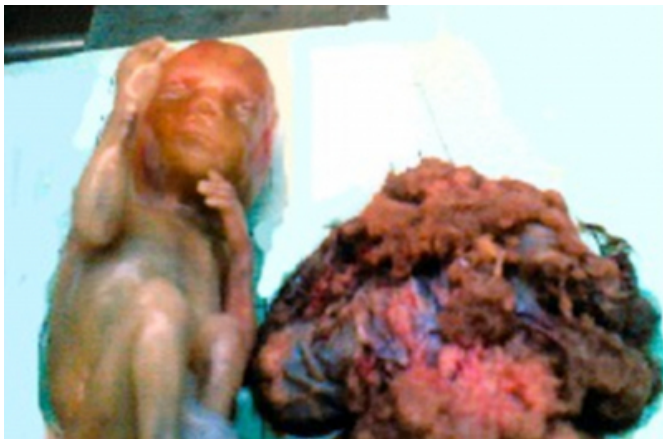
Figure 2: Image of fetus and placenta in ruptured cornual ectopic pregnancy at 18 weeks' gestation