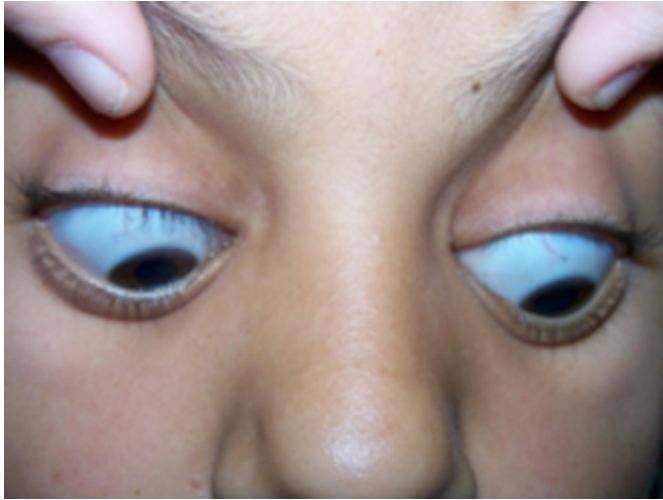
Fig 2: Blue Sclera

Laboratory investigations revealed normal haemogram, KFT, serum Na + & K + . Serum Ca 2+ was 7.6 mg% which improved to 9.8 mg% after calcium supplementation. Serum free T 3 (3.58 pg/ml) was slightly out of range (1.45-3.48 pg/ml) while free T 4 was within normal limits. There was increased translucency of posterior ends of 2nd -7th ribs on chest X-ray. ECHO, done to rule out any valvular involvement, was found to be normal.