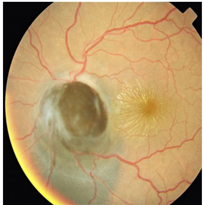
Figure 1 : Fundus Photograph

Indirect ophthalmoscopy, B-scan, fluorescein angiographies and MRI further confirmed findings. (Figure 2 & 3 )