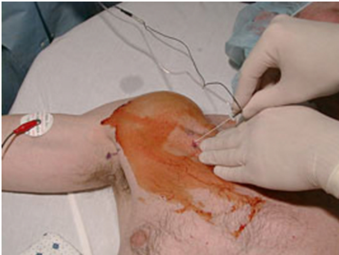
Figure 4: A 10 cm long 22 G insulated needle, attached to a nerve stimulator is inserted and advanced toward the axillary artery. The needle usually assumes a 60 degree angle to the skin plane. Initial stimulating current is 0.6-0.8 mA.

With this approach, the needle commonly assumes an angle of 60° to the skin plane. The needle is slowly advanced until the twitches from hand or forearm are obtained (Figure 5).