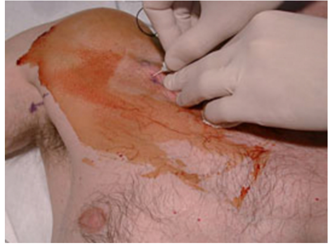
Figure 5: Brachial plexus is reached at the depth of 6-8 cm.

The initial current of 0.6-0.8 mA is decreased to below 0.3 mA at which point 40 -50 ml of local anesthetic is injected (Figure 6).