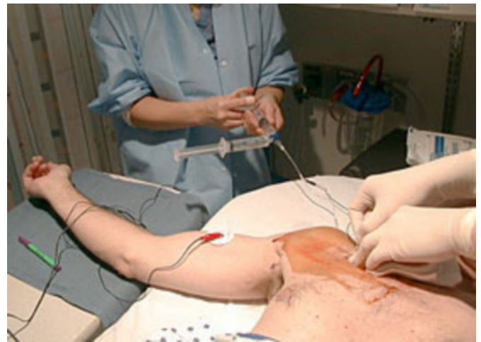
Figure 6: The stimulating current is then gradually decreased until the sought response is still present at 0.3 mA or less. After negative aspiration for blood, 40-50 ml of local anesthetic is injected.