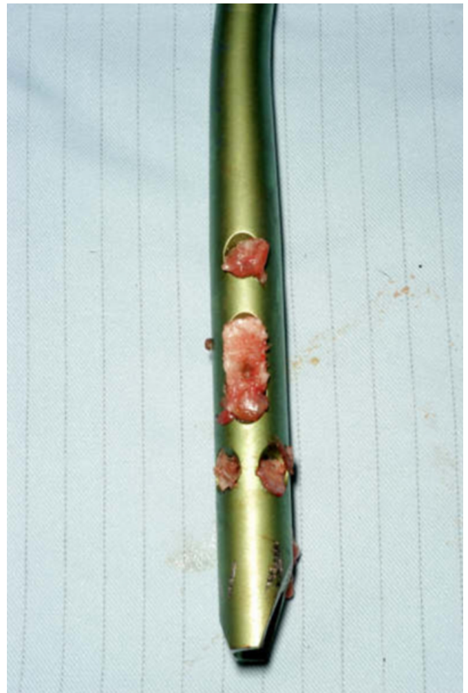
Figure 3: AO intramedullary cannulated tibial nail (CTN) after removal, showing bone ingrowth within both proximal diagonal and dynamic locking holes.

Initially, attempts to extract the screw using the slotted hammer failed to drive the nail proximally. Few gentle taps on the nail, driving it distally, facilitated removal. After removal, bone growth within the proximal diagonal and dynamic locking holes was noticed (figure 3). This may explain the difficulties encountered during engaging the extraction screw and extraction of the nail (figure 4). Post operative course was uneventful.