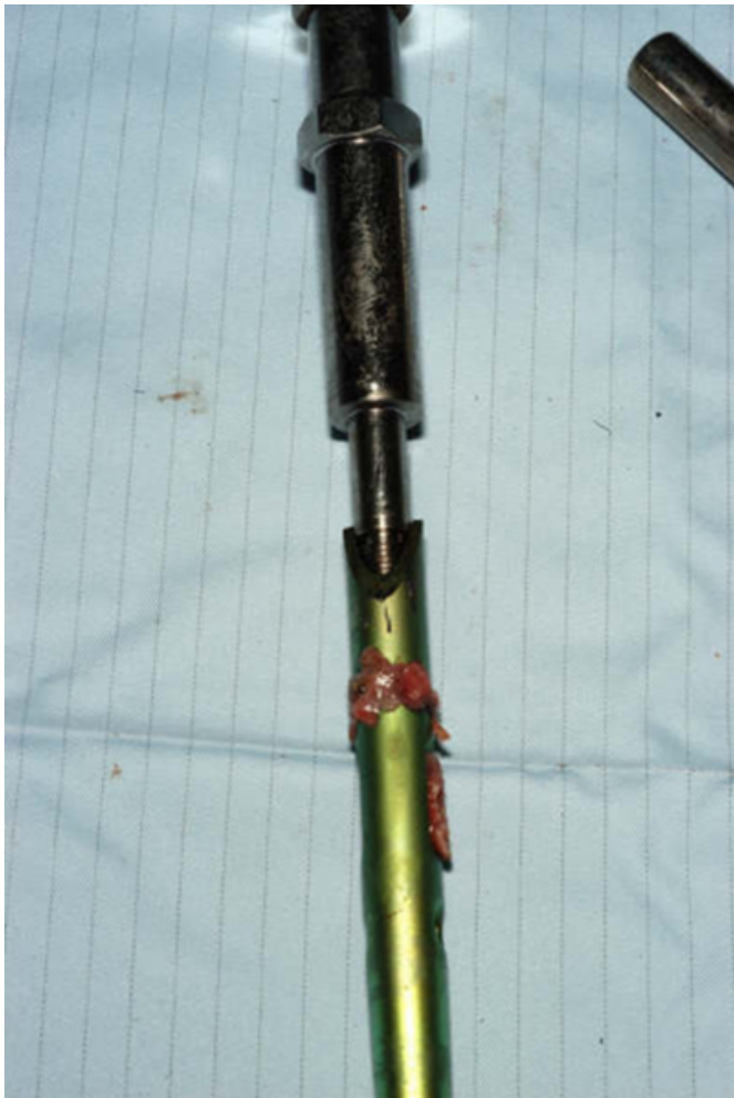
Figure 2: Extraction screw (Ipswich Extractor System) engaging well within the nail's threads.