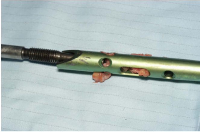
Figure 4: AO extraction screw was prevented from advancing into the proximal end of the nail by the bone ingrowth within the diagonal hole. Note that even if the extraction screw tip bypassed the diagonal hole, further advancement to engage into the nail's threads would still be prevented by the larger ingrowth within the dynamic hole.