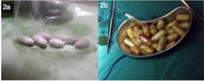
Figure 2: Cocaine pellets confiscated from detained body packers in Jamaica. Multiple pellets spontaneously evacuated by an offender. Surgically extracted pellets from the stomach of an offender.

Body packing is rampant in Jamaica because there is a large population of impoverished persons with an estimated 15% prevalence of unemployment. ([3]) The drug trade organizations target these individuals using the lure of enormous financial rewards. ([12348]) It has been reported that body packers can earn between £2,000 and £5,000 (US $3,960 to $9,906) per successful trip. ([3])