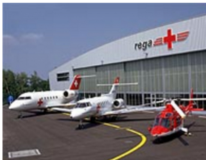
REGA fleet in Zuerich-Switzerland