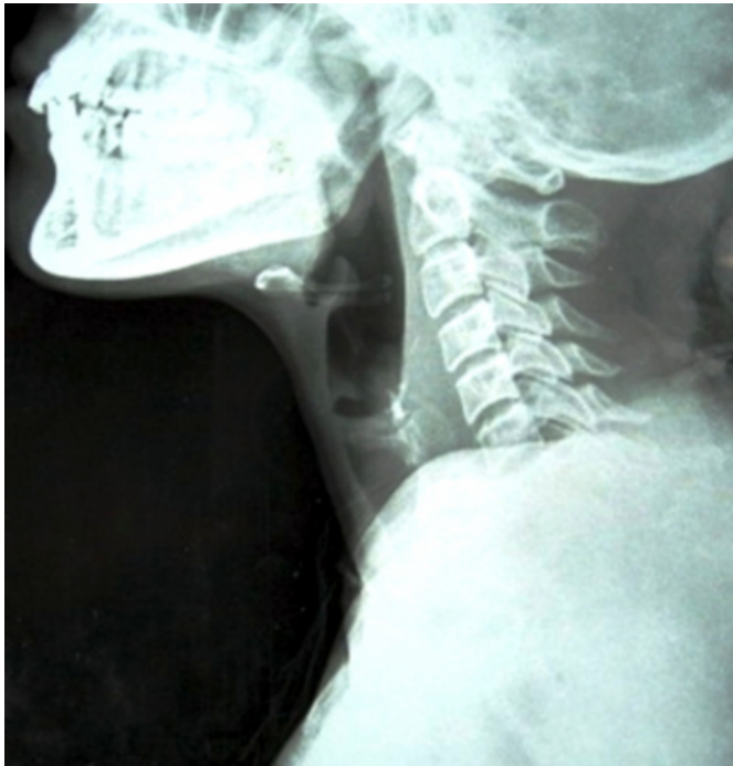
Figure 1: X ray soft tissue neck lateral view showing widening of prevertebral space in front of 5 and 6 cervical vertebra.

Flexible endoscopy photographs revealed pooling of saliva in pyriform sinus ( figure 2).