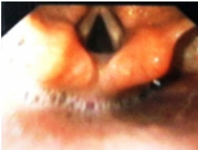
Figure 2 : Endoscopy photograph showing pooling in pyriform

Another picture revealed foreign body impacted in cricopharynx Figure 3.