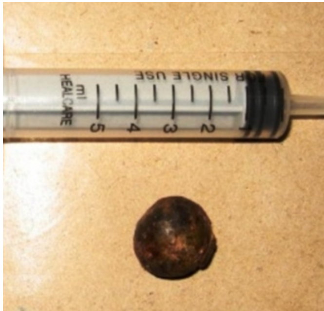
Figure 4: Foreign body after removal measuring 2 cm in size.

The foreign body was swollen, due probably to hygroscopic action of some chemicals in the ayurvedic tablet. Post operative the patient had immediate relief of symptoms and the patient was able to take well orally.