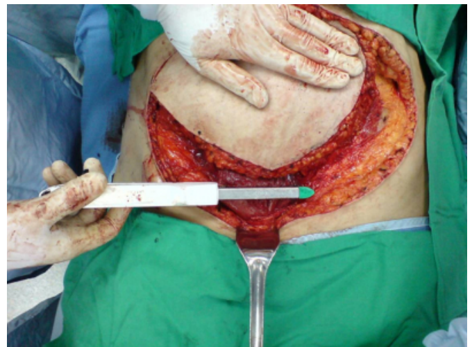
Figure 1. The stapler device GIA 80 has been applied on the caudal portion of transverse rectus abdominis muscle

Additional staple cartridges can be used in case of athletic subjects with muscle wider than cartridge and anvil forks. As a result we get an even edge of the muscle sutured by metallic staples without bleeding (fig. 2).