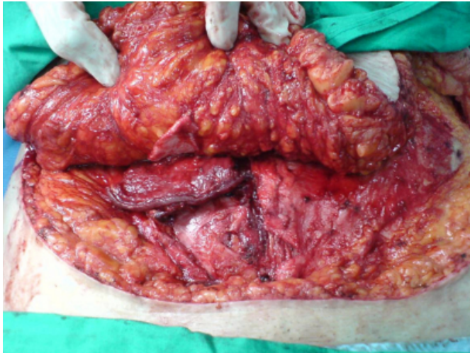
Figure 2. The transverse rectus abdominis muscle has been cut and sutured by metallic staples with no bleeding.

Later on, monofilament monocryl 3/0 stitches (Ethicon Inc, a Johnson-Johnson company) are applied between the caudal and lateral borders of the muscle, anterior rectal sheath and subcutaneous tissue to secure the flap (fig. 3).