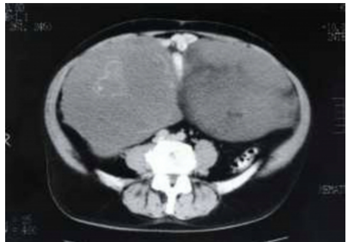
Figure 1. CT scan of the abdomen and pelvis revealing the presence of multiple large masses filling the abdomen and pelvis

Past surgical history included two inguinal herniorrhaphies approximately three years prior, nasal polypectomy, and right carpal tunnel surgery. Past medical history included BPH, hypercholesterolemia, hypothyroidism, and vitiligo. The patient had no known allergies. Home medications were prevacid, synthroid, and oxybutrin. The patient did not use tobacco or drugs and socially consumed ETOH. Physical exam was benign with the exception of a markedly distended abdomen that was soft, non-tender, without peritoneal signs, and bowel sounds were hypoactive. The patient's stool was hemocult negative. Initial laboratory values were: WBC 10.8; HgB 12.6; HCT 40.6; PLT 295; MCV 77.3; MCH 24.0; MCHC 31.0; RDW 16.1. The patient's coagulation studies and chemistry profile were within normal limits.