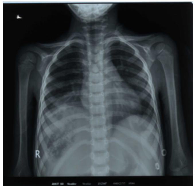
Figure 1: X-ray showing a hypodense lesion in the right upper abdomen

Sonography of the abdomen revealed a collection of varying echogenicity below the right dome of the diaphragm and