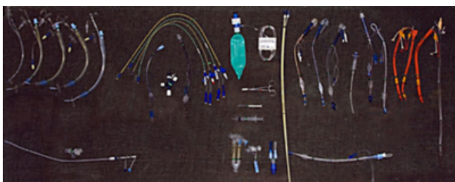
Figure 1: Hard version of TATB