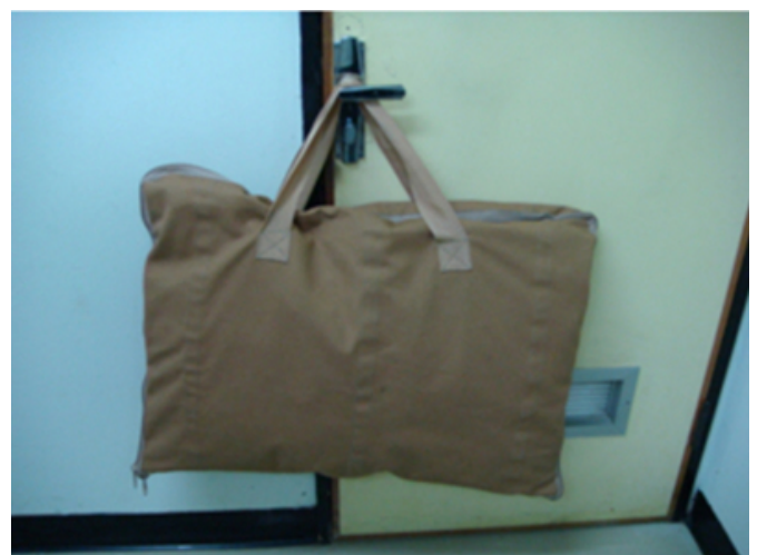
Figure 3: Thoracic case